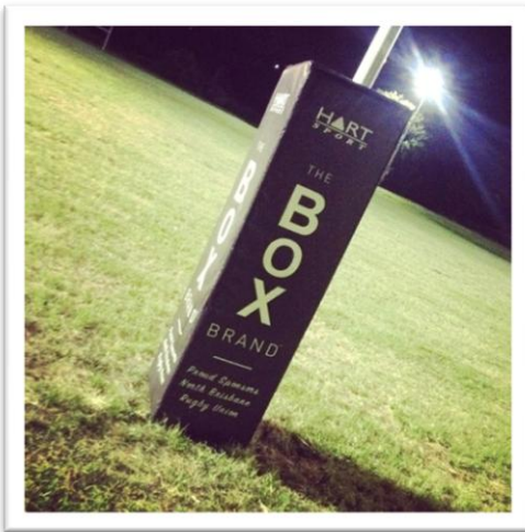
Example of a Goal Post Protection Pad

Note – this was the layout used in 2010 and as such it will need to be modified to meet 2015 ARC Division 3 Tournament requirements.